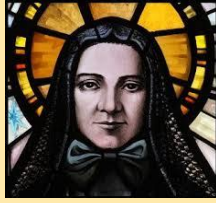
St. Frances Xavier Cabrini November 13