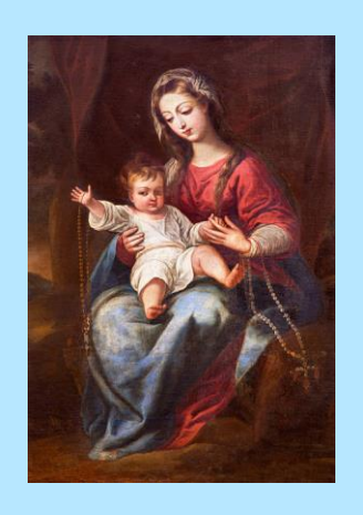
Our Lady of the Rosary October 7